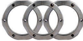
Hub Lock Nut