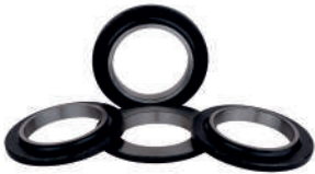
Spacer Table Shaft