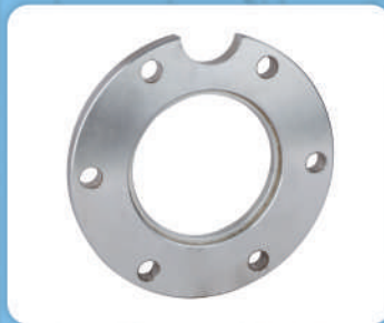
Cable Slot Flange