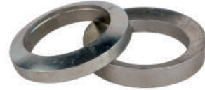
Upper Lower Washer