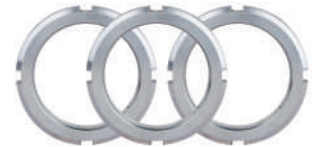
Lock Nut 2