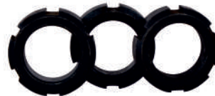
Lock Nut 1