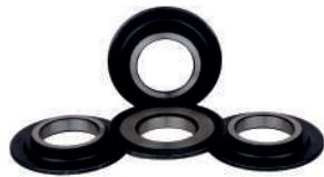
Spacer Oil Sling