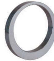
Out Centering Ring